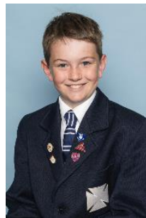
Cultural Prefect Luc Morland