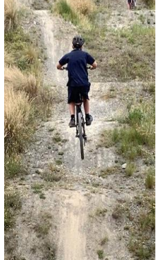
2025 Pyne House Leaders