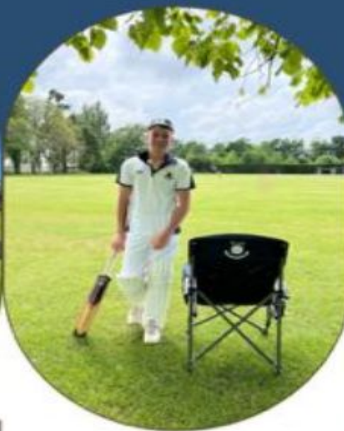
SPORTS SUPPORTER COMFORT